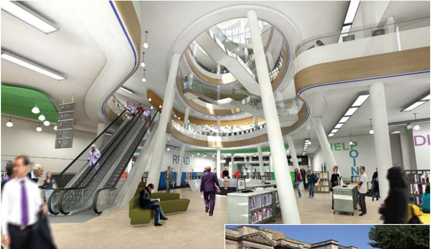
How the atrium of the refurbished library will look

The £50m Central Library and Archive redevelopment is a partnership between Liverpool City Council, Central Government and Inspire Partnership and will deliver a world class library in the centre of Liverpool. It will restore the fabulous historic fabric of the building providing high class visitor facilities with excellent access to the library's book collections and archive services. There will also be a highly visible welcoming entrance and new storage facilities for the archives and rare books to exacting modern standards.